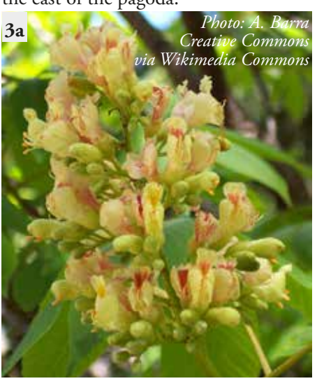
Figure 3 Yellow Buckeye, Aesculus flava: This species is originally from Eastern USA. There are number of these trees to the east of the pagoda.