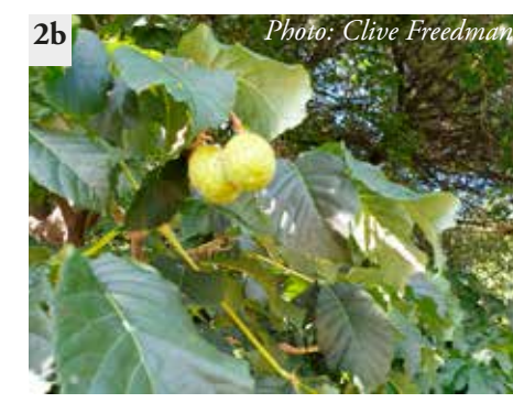
2b The seed capsules are hardly spiny at all compared to A. hippocastanum.

Figure 3 Yellow Buckeye, Aesculus flava: This species is originally from Eastern USA. There are number of these trees to the east of the pagoda.