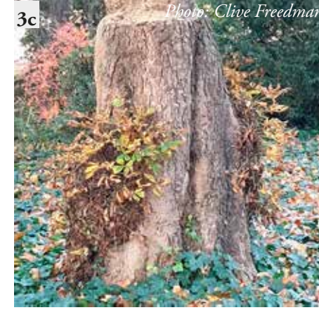
3c This species does not do very well from seed so specimens in the Park are grafted onto European White Horse Chestnut stocks. Contrast the leaves on this lower trunk with 3b.