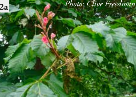
2a The leaflets are 'crinkled' compared to Fig 1a and the toothed leaflet edges extend around the whole margin. Also, there are usually only five leaflets.