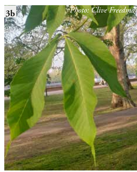
3b The leaflets are long and tapering to a point.